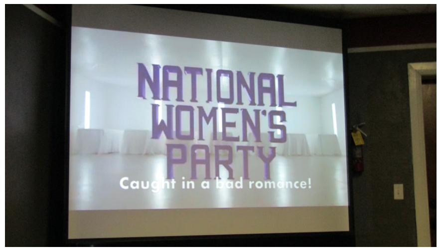
Music Video "Bad Romance" By Lady Gaga

View all pictures from our Nov. 2, 2020 meeting at https://gammaetatexas.weeb ly.com/